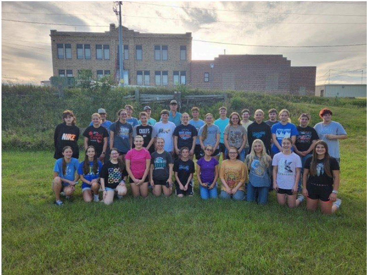
Litchfield FBLA and FFA students at their combined kickoff event on August 23.