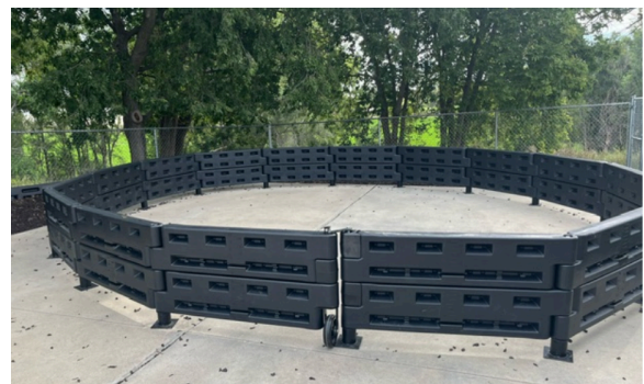
The new Gaga Ball pit located on the playground in a brief moment of rest.

Addy Moser was the first reported knuckle-scraping-on-concrete injury, but after getting bandaged back up, she headed right back out there!