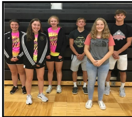
FBLA Officers 2020-21