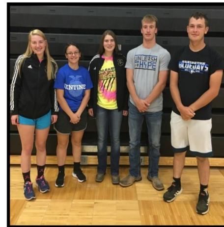
FFA Officers 2020-21