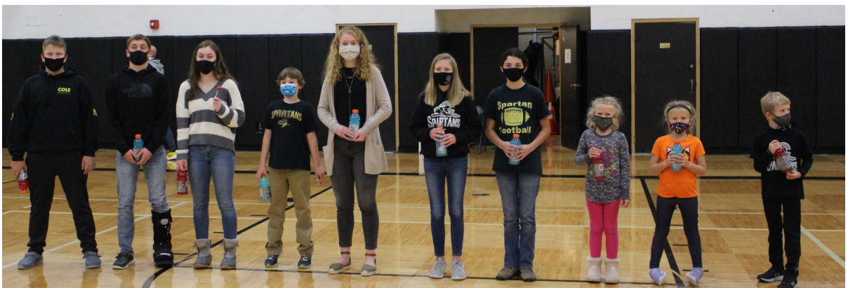
Maps score excellence recipients

So many students were included in the pep rally. We have so many kids going out for activities, sports and doing their best in the classroom. We truly have a lot to celebrate. The first quarter has been a success and we look forward to seeing what our students do next. Thanks for all of your work first quarter!